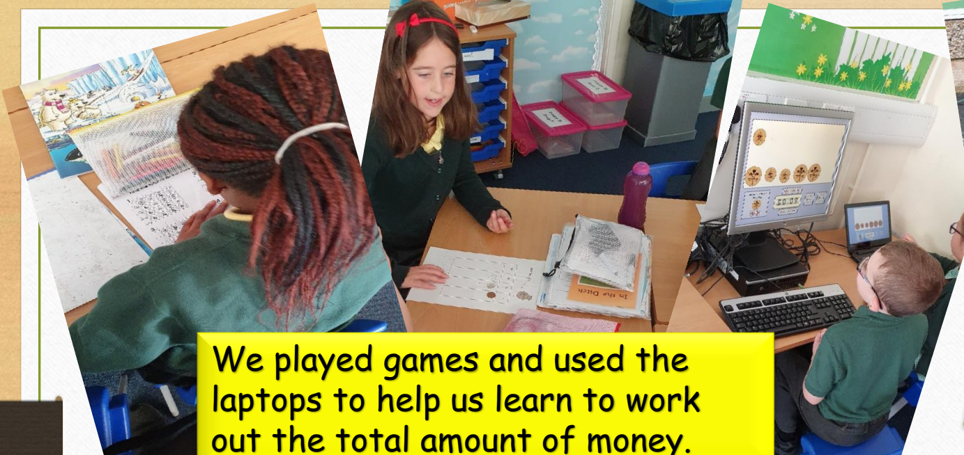
We played games and used the laptops to help us learn to work out the total amount of money.