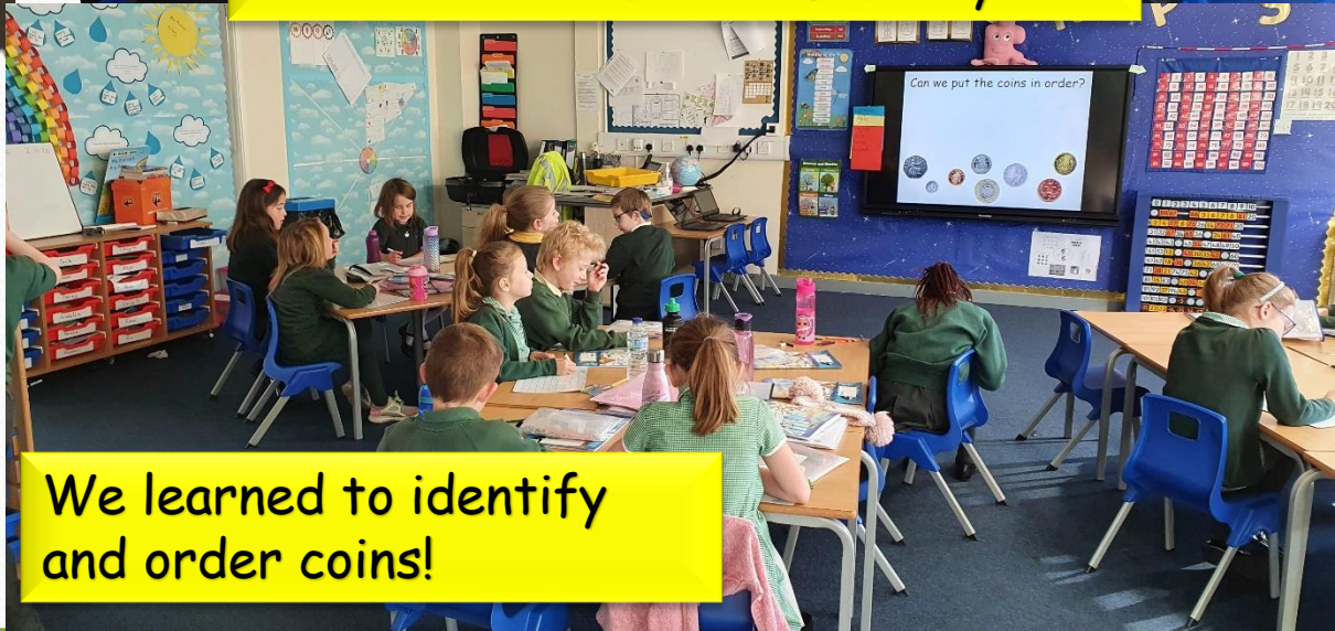
We learned to identify and order coins!