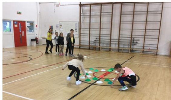
We collected cones of different values and had to make the highest number in PE