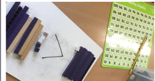
We used different materials to make greater than & less than numbers