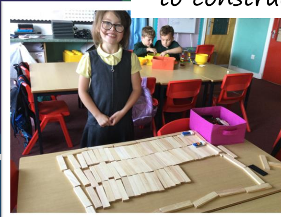
We used different shapes to construct our castles