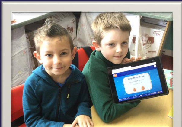
We used technology to improve times tables